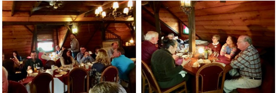
MBCA Central VA holiday party

Thank you to everyone that came to our annual Christmas Holiday party on January 21 th at the Bavarian Chef located in Madison, VA. It was a good day for traveling with warm weather. Once again the Bavarian Chef delivered great (and plentiful) food and a good time for all.